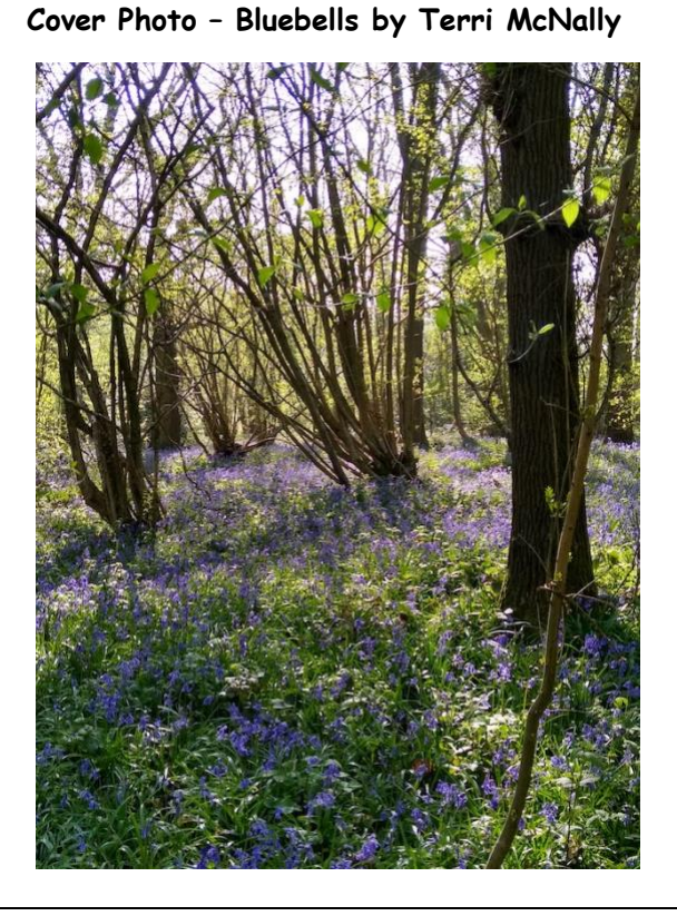
FSW Calendar 2022