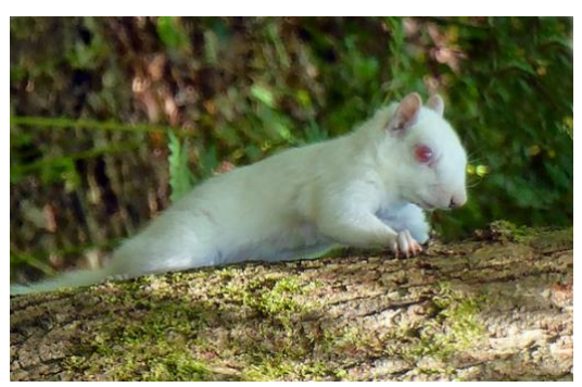
January Albino Grey Squirrel by Tony Flecchia