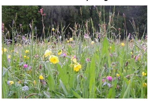
\frac{\text{June}}{\text{Meadow in the Rain by Mogens Holmen}}