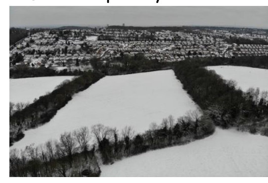
February Drone snow