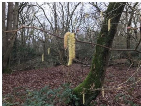
6/1/24 - Ripe Hazel catkins widespread throughout the wood