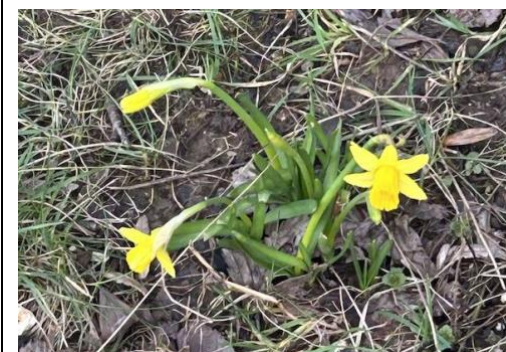
15/2/24 - Daffodils in Field 2 – a tribute planting by a bench