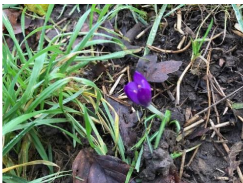
10/2/24 - Crocus by the car park