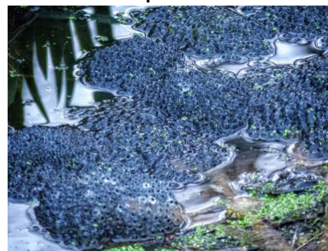
18/2/24 - Frogspawn in the Jubilee pool