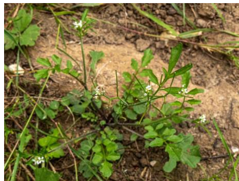
25/1/24 - Tiny Bittercress flowers in Middle Gorse