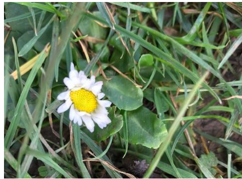
18/2/24 - Daisy – in Field 1 looking rather crumpled