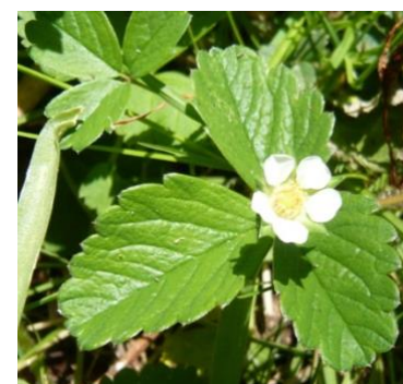
28/1/24 – Wild Strawberry in Middle Gorse