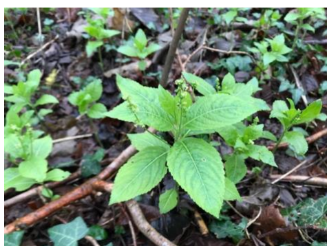
18/2/24 - Dog's Mercury – strange tiny flowers