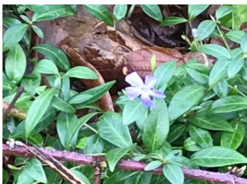
11/2/24 - Periwinkle in Linden Glade