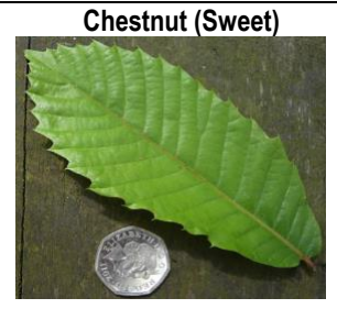
Leaves are large and glossy, oval in shape and deeply toothed