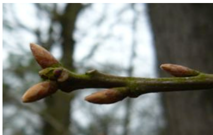
English Oak Buds

Buds brown and stubby arranged alternately along the twig with a cluster of terminal buds.