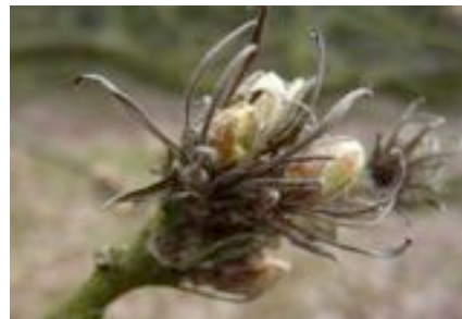
Turkey Oak Buds

Weird, hairy terminal buds that are very different from those of the English Oak.