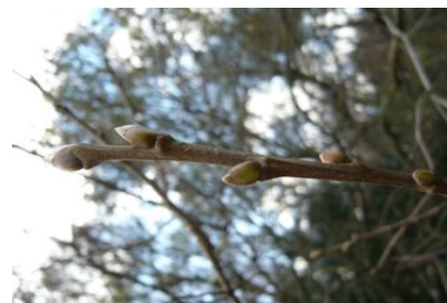
Sweet Chestnut Buds

Greeny brown buds arranged alternately along the twig with a single terminal bud.