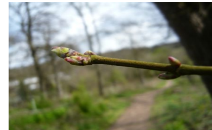
Field Maple Buds

Similar to Sycamore but twigs are more green and buds more elongated. Buds have a furred appearance similar to Beech - see below.