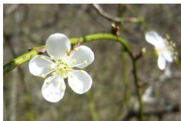
In David's Crook 21/3/18 (5/3/17) (23/2/16) (no 2015 date recorded)