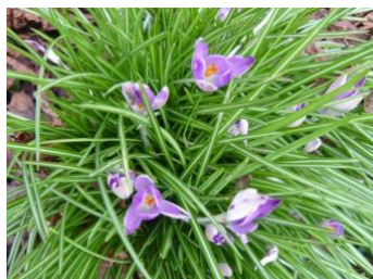
Tribute planting by Heather Creamer's seat in F2 13/3/18 (1/3/17) (21/2/16) (7/3/15)