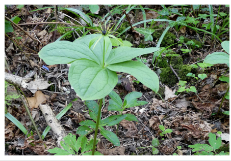
HERB PARIS (The FSW logo)

† Goldilocks is the UK's only woodland buttercup - it has straggly growth, small flowers and grows two different shapes of leaf.