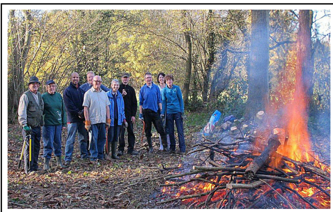
THE FRIENDS TAKE A WELL EARNED BREATHER

* Also see Selsdon Gazette & Forestdale Link .