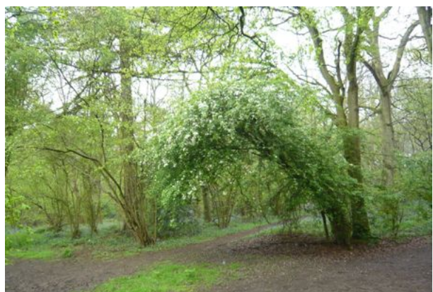
This Midland Hawthorn curving over the path is at the end of the Wend where it joins Steven's Walk (above left 3/5/12) and a Common Hawthorn at the top of Field 2 by the path (top right 16/5/12).

Take a walk in early spring (March/April) and look for the Hawthorns, which are the first bushes coming into leaf. A month later, spot the white blossom. Can you tell the difference between the Midland and Common Hawthorns?