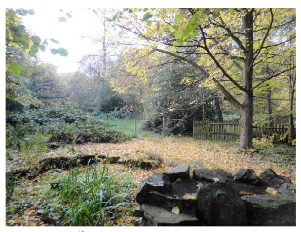
Linden Glade - 1<sup>st</sup> November 2011

Finally, we must not forget the birds and smaller animals – please keep the bird-bath topped up. Only you can do that.