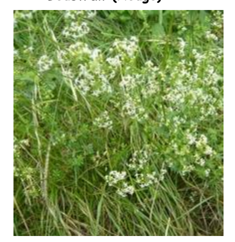
June-Sept - field borders Leaves - in whorls, smooth Flowers - tiny - loose clusters