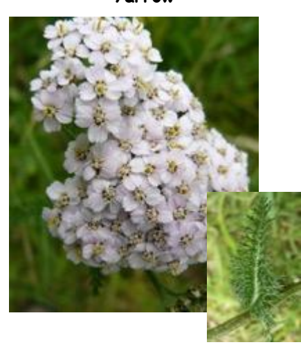
June-Nov - field edges Leaves - pinnate, feathery Flowers - small, dense clusters