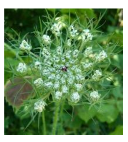
June-Sept - paths Leaves - pinnate Flowers - umbels - centre red