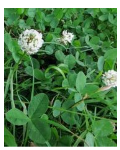
May-Oct - fields Leaves - trefoil Flowers - medium, round