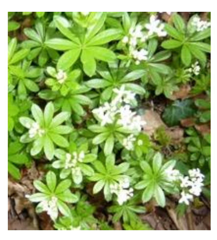
April-June - Broad Walk Leaves - in whorls Flowers - tiny in loose heads