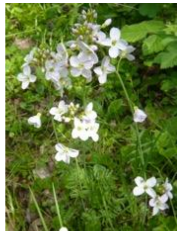
April-June - woodland paths Leaves - pinate, rosette at base Flowers - small