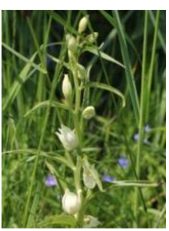
May -July - field edges Leaves - oval Flowers - medium, in spikes Orchid family - uncommon