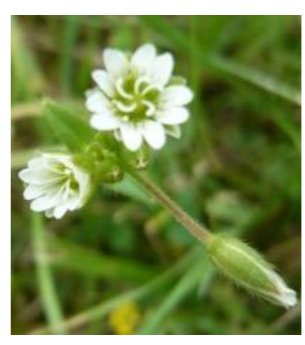
April-Nov - field paths Leaves - oval Flowers - tiny, lose clusters