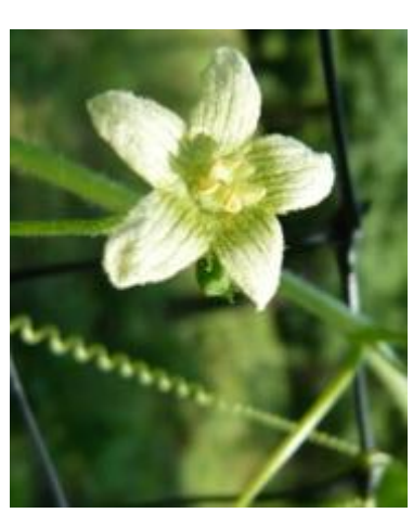
May-Sept - woodland paths Leaves - ivy shaped - tendrils Flowers - medium