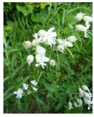
May-Sept - fields Leaves - pointed, oval Flowers - medium