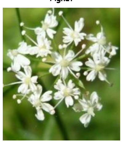
May-July - Farleigh Border Leaves - thread-like Flowers - small, in umbels