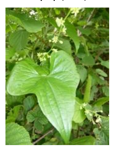
May-Aug - woodland paths Leaves - heart shaped Flowers - tiny in spikes