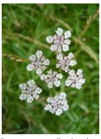
June-Aug - woodland paths Leaves - pinnate Flowers - small, in umbels