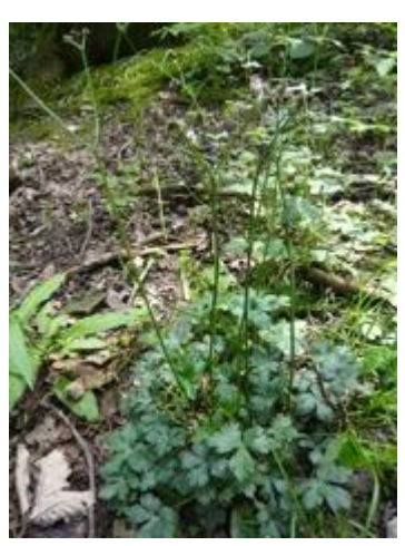
May-July - woodland paths Leaves - palmate, shiny, dark Flowers - tiny, clustered umbels