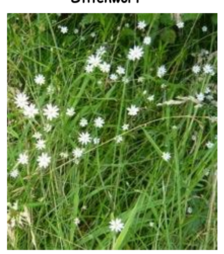
April-June - Farleigh Border Leaves - narrow Flowers - medium