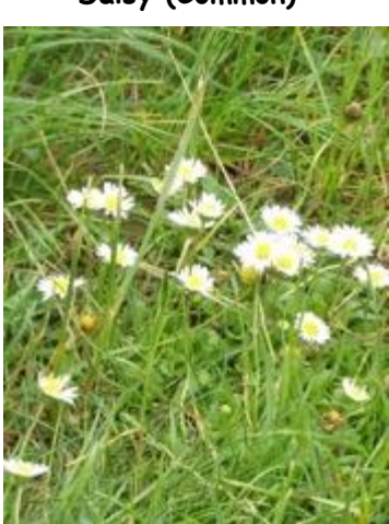
April-Nov -fields Leaves - spoon shaped, rosette Flowers - medium, low growing