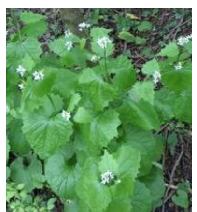
April-Aug - woodland paths Leaves - heart shaped Flowers - small, in clusters Leaves smell of garlic