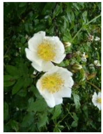
July-Aug - field hedgerows Leaves - pinnate Stems - thorny Flowers - large, solitary