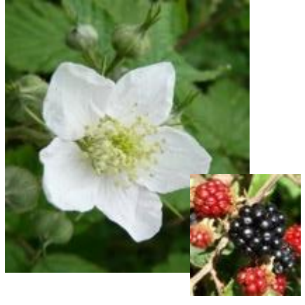
May-Nov - woodland paths Leaves - prickly - thorny stems Flowers - medium Fruit - blackberries