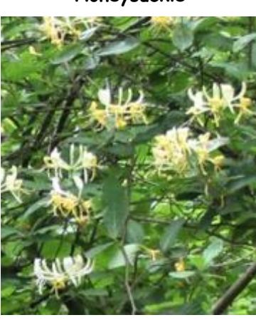
June-Oct - woods Climber - Leaves - smooth, oval Flowers - tubular in a head Flowers highly scented