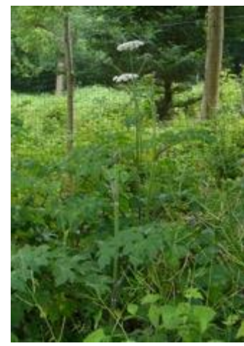
April-Nov - path edges Tall - Leaves - large, pinnate Flowers - tiny, in large umbels