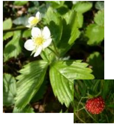
April-July- field borders Leaves - pinnate, trefoil Flowers - small Fruit - see inset