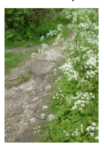
April-June - path edges Leaves - pinnate Flowers - small, umbels