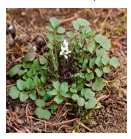
Feb-Nov - woodland paths Leaves - pinate, in whorl Flowers - tiny