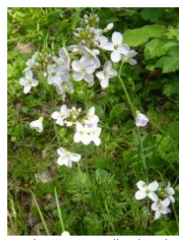
April-June - woodland paths Leaves - pinate, rosette at base Flowers - small