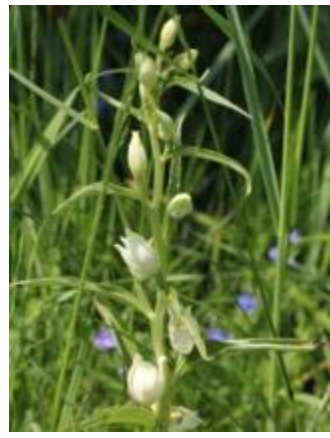
May -July - field edges Leaves - oval Flowers - medium, in spikes Orchid family - uncommon