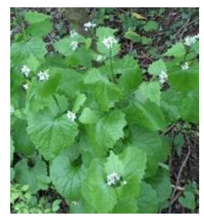
April-Aug - woodland paths Leaves - heart shaped Flowers - small, in clusters Leaves smell of garlic