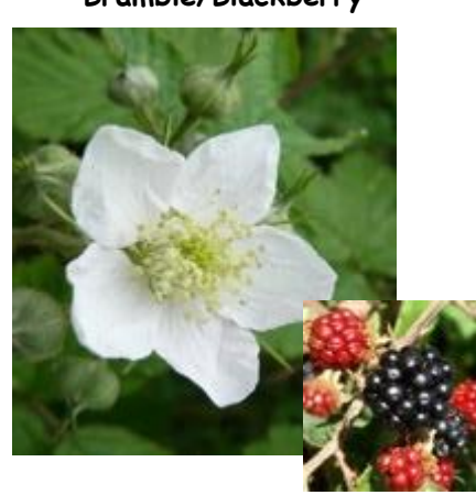
May-Nov - woodland paths Leaves - prickly - thorny stems Flowers - medium Fruit - blackberries