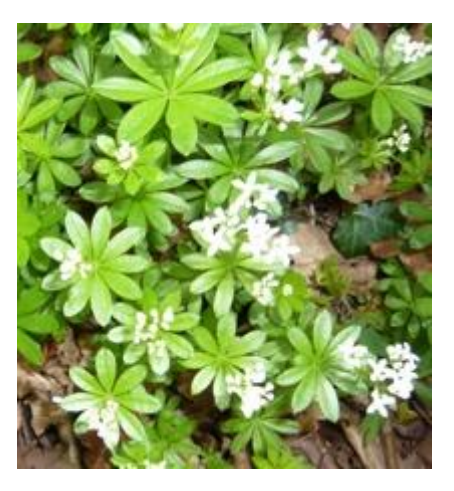
April-June - Broad Walk Leaves - in whorls Flowers - tiny in loose heads