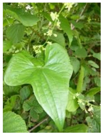
May-Aug - woodland paths Leaves - heart shaped Flowers - tiny in spikes