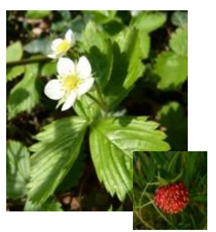
April-July- field borders Leaves - pinnate, trefoil Flowers - small Fruit - see inset