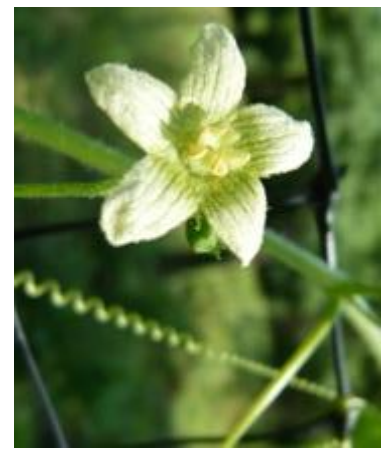
May-Sept - woodland paths Leaves - ivy shaped - tendrils Flowers - medium