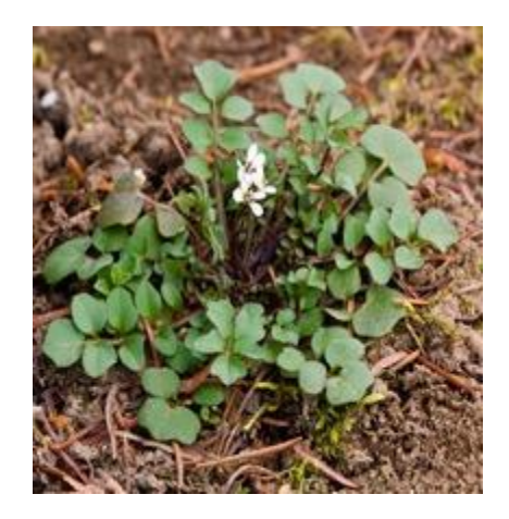
Feb-Nov - woodland paths Leaves - pinate, in whorl Flowers - tiny