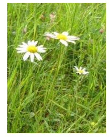
May-Sept - fields Leaves - clasping stem Flowers - large, tall