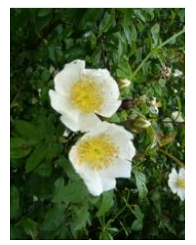
July-Aug - field hedgerows Leaves - pinnate Stems - thorny Flowers - large, solitary