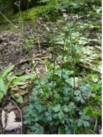
May-July - woodland paths Leaves - palmate, shiny, dark Flowers - tiny, clustered umbels