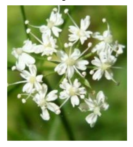
May-July - Farleigh Border Leaves - thread-like Flowers - small, in umbels