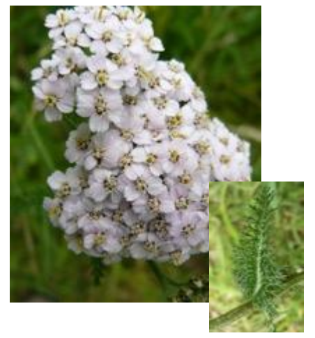
June-Nov - field edges Leaves - pinnate, feathery Flowers - small, dense clusters