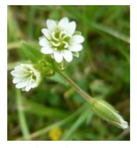
April-Nov - field paths Leaves - oval Flowers - tiny, lose clusters