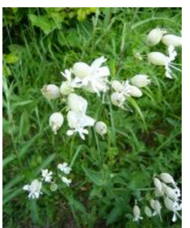
May-Sept - fields Leaves - pointed, oval Flowers - medium