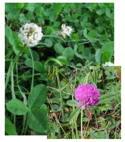
May-Oct - fields Leaves - trefoil Flowers - medium, round