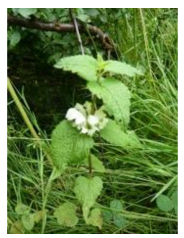
March-Nov - field paths Leaves - heart-shaped Flowers - small, in whorls