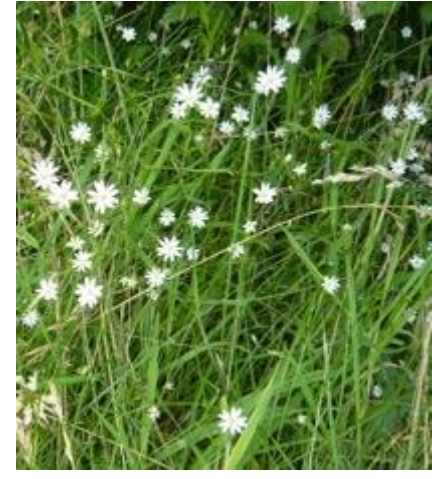
April-June - Farleigh Border Leaves - narrow Flowers - medium