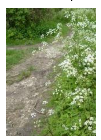
April-June - path edges Leaves - pinnate Flowers - small, umbels