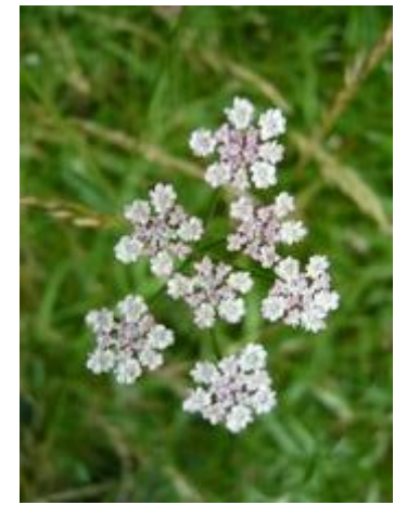
June-Aug - woodland paths Leaves - pinnate Flowers - small, in umbels