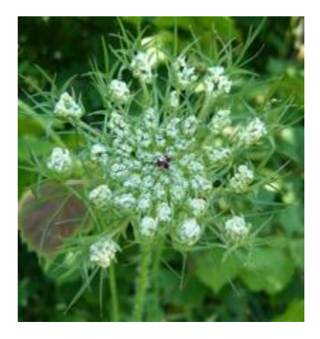
June-Sept - paths Leaves - pinnate Flowers - umbels - centre red