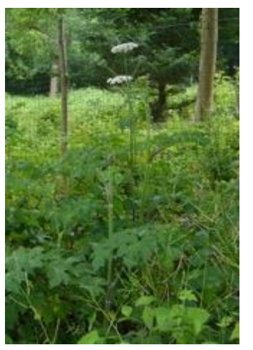
April-Nov - path edges Tall - Leaves - large, pinnate Flowers - tiny, in large umbels