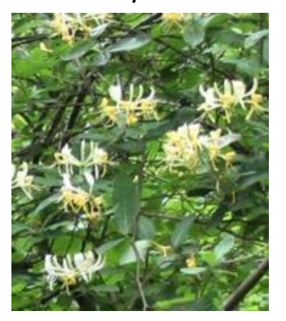
June-Oct - woods Climber - Leaves - smooth, oval Flowers - tubular in a head Flowers highly scented