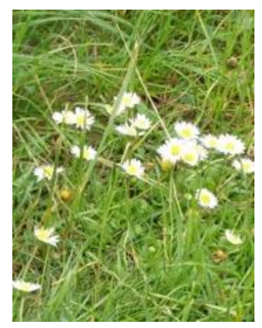
April-Nov -fields Leaves - spoon shaped, rosette Flowers - medium, low growing