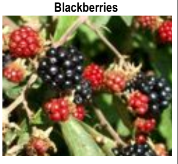
The fruit of Bramble bushes - widespread in field borders and in the woods.