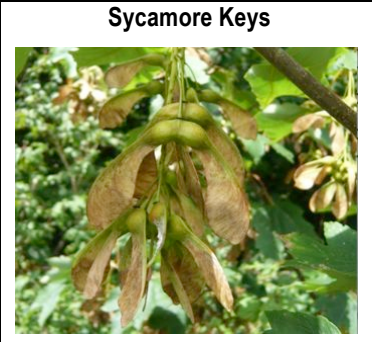
In western woods and field borders eg the northern edge of David's Crook