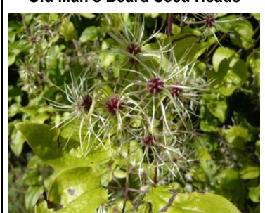
In Woods and field borders eg Great Field bordering Steven's Larch