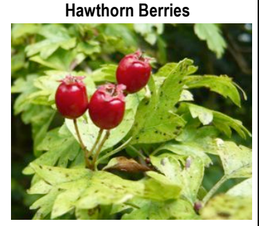
In many field borders and in woodland areas especially Courtwood Grove.