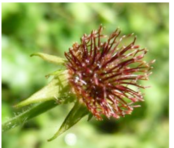
Widespread in woodland areas seed head of a small flower growing beside many paths