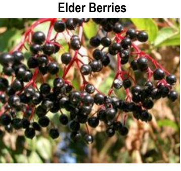
At the corner of Vincent Avenue near the Jubilee - also along the western edge of Field 2.