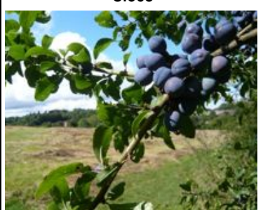
The fruit of Blackthorn bushes growing along many field borders eg David's Crook.