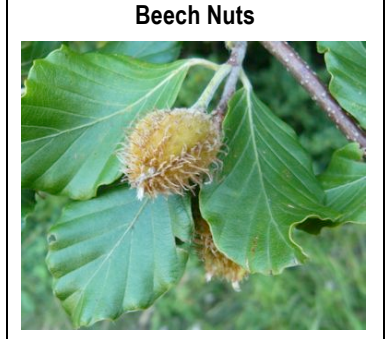
In southern woods and several heavily laden trees on the eastern edge of Field 2.