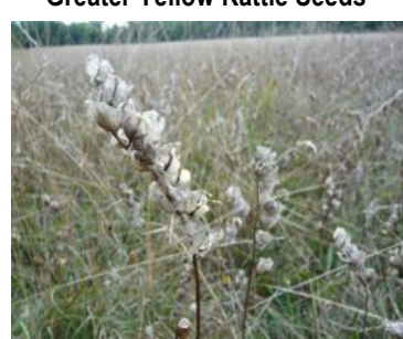
Widespread in the fields. Give one a shake! to discover how it gets its name!

phone: 020-8657 0423 e-mail: selsdonwood@gmail.com website: www.friendsofselsdonwood.co.uk