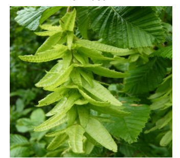
Several trees along the eastern edge of Field 2 and western edge of Field 3.