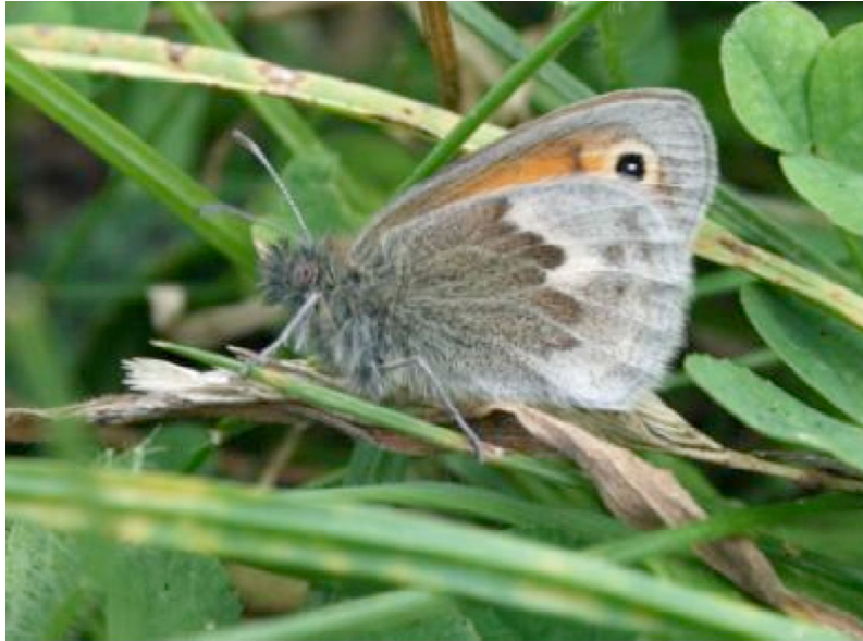
Finlay visited the woods on the occasion of the FSW Minibeast Hunt and walked round with his grandfather's camera taking some amazingly detailed photographs.

The Friends would like to thank everyone who contributed and to remind all you photographers that the 2013 competition starts now. In the past there has been a shortage of photographs from autumn and winter so please do take your cameras with you when you visit the woods over the next few months to redress that imbalance in the 2013 competition. You can send your entries to FSW at any time and we will be happy to hold on to them ready for printing and judging at the Open Day next year.