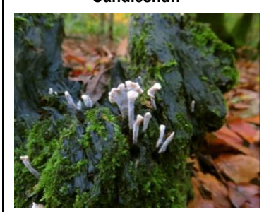
A small fungus that looks like the snuffed wicks of candles. Common on mossy stumps.