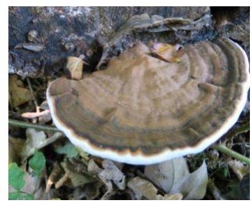
A sturdy bracket fungus. A huge, old, example can be seen on a dead tree in Vale Border.