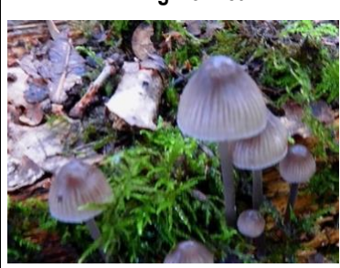
One of many species of bonnet shaped fungi.