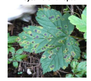
Spots on Sycamore and Maple leaves. Does not damage the tree but causes early leaf fall