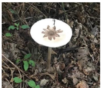
A mushroom with a pretty pattern on the cap..