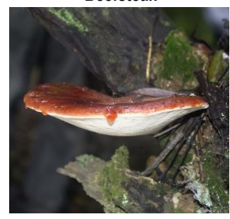
Very widespread this year. Often appears to be "bleeding" as here.