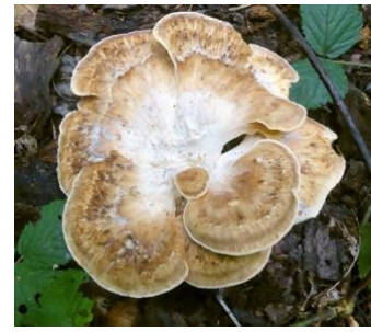
A large fungus as the name suggests. The underside has pores not gills.