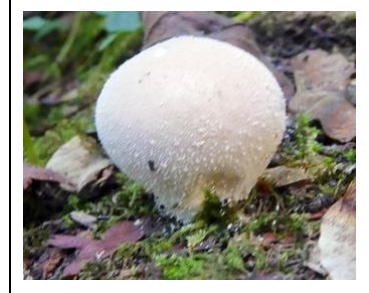
Round, common fungus. Spores are released in a puff when it is touched.