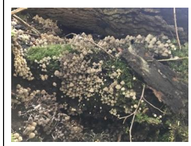
Very tiny bonnets. Often seen in vast groups - as here.