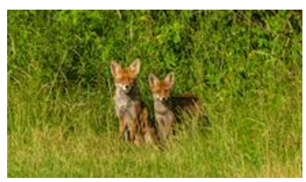
<u>June</u> Looking at Me, Looking at You by Ruth Budd