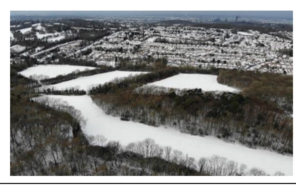
<u>April</u> Gates of Heaven by Balázs Dukát