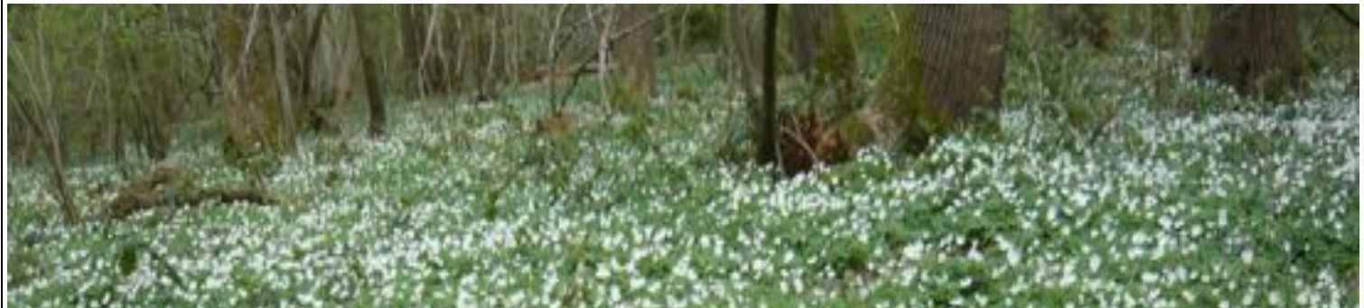
Carpets of anemones clothing the northern woods (eg Addington Border) and perfuming the air with their delicate scent.

Do join us on May 2 nd for all this and more.