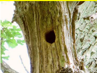
Woodpecker Nest Hole

- high up in trees throughout the wood - spot one in Pool Grove