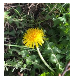
Dandelion - 4th March

First spotted by the Courtwood Lane gate. Now dotted throughout woodland areas