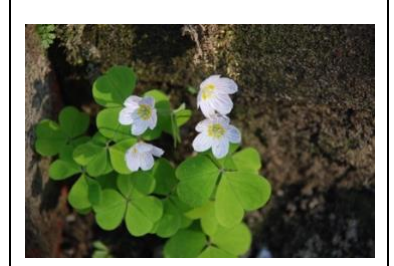
Wood Sorrel - 25th March

Mixed in among the Anemones this flower can easily be missed, but it has a very distinctive trefoil leaf