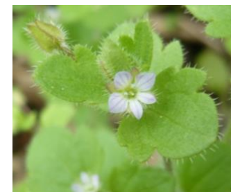
Lilac Ivy-Leaved Speedwell -21st March

The smallest Speedwell and usually the first to flower.