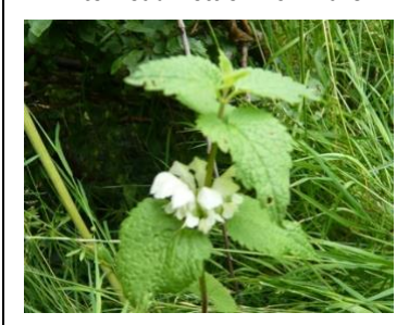
White Dead-nettle - 25th March

Growing in the usual place beside the car park