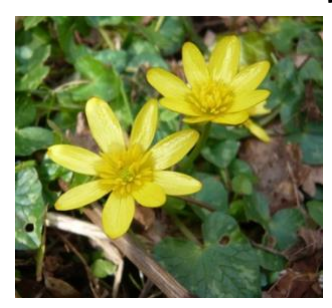
Lesser Celandine - 28th February

First spotted by the Courtwood Lane gate. Now dotted throughout woodland areas