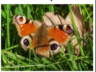
Peacock Butterfly - 16th March

Perhaps the most striking butterfly in our wood. Look out for them in the summer months