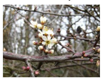
Blackthorn blossom -25<sup>th</sup> February

This was an early first showing. These bushes are in full bloom now and run along the edges of many of the fields.