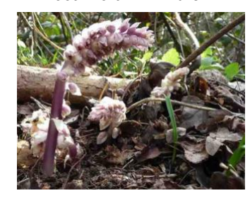
Toothwort - 24th March

A rare and strange little parasitic plant which recurs each year in the same place in East Gorse.