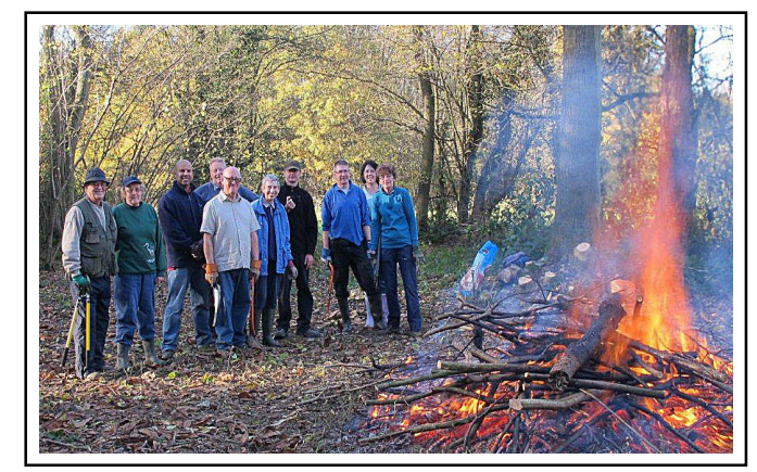
THE FRIENDS TAKE A WELL EARNED BREATHER

* Also see Selsdon Gazette & Forestdale Link.