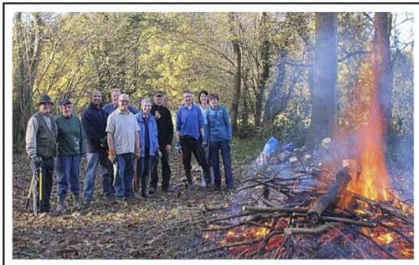
THE FRIENDS TAKE A WELL EARNED BREATHES !