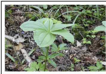
HERB PARIS (The FSW logo)